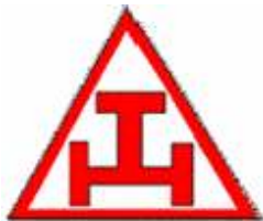
The Capitular Degrees